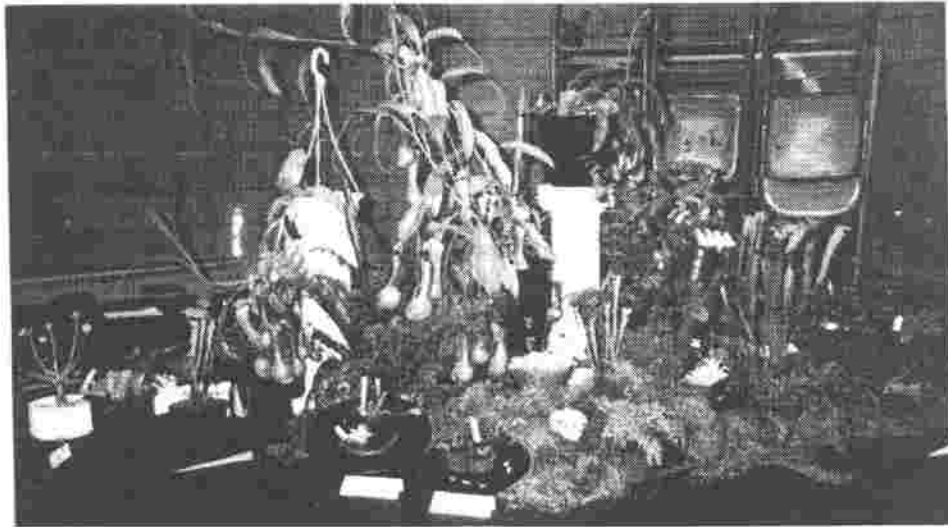
1997 S. F. Flower Show carnivorous plant display

One generation plants the trees; another gets the shade. - Chinese Proverb